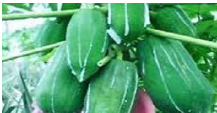
Figure: Carica papaya Latex

In this research, the uterotonic principles, papaya latex extract (PLE) was tested on rat uterine preparations in vitro at various stages of the estrous cycle and gestation periods. Author observe, increased Rat uterine contractile activity on different doses of PLE in proestrus and estrus stages compared to metestrus and diestrus stages of the estrous cycles. A direct dose-dependent spasmodic action with increased frequency and amplitude was observed with PLE in all non-gravid uterine preparations. Pretreatment of the tissue with phenoxybenzamine (PB) non-competitively blocked the effect of PLE. Blocking of the 5-HT receptors with methysergide partially blocked the excitatory response to PLE. From this work the crude papaya latex have an uterotonic principle which can bring