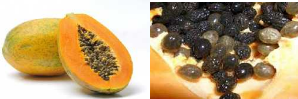
Figure: Carica papaya fruits and Seeds

In this study, the pretreatment with aqueous extract of Carica papaya seed exhibited anti ulcerogenic and antioxidant effects, which may be due to the enhanced antioxidant enzymes. On the basis of