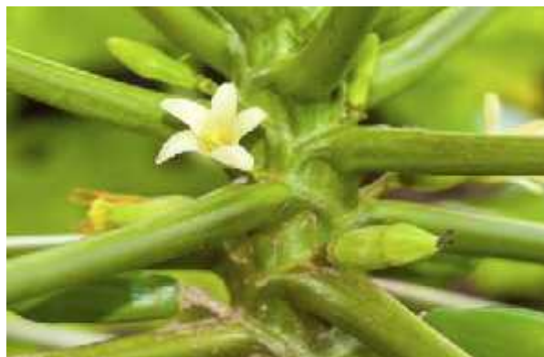
Figure: Carica papaya leaves and Flower

Papaya plants are used medicinally in different countries and are sources of many potent and powerful drugs. Antimicrobial and antifungal activity of Carica papaya (Papaya) plant different leaves extract is tested by methods reported in literature. Phytochemical screening of leaves extracts for alkaloids, carbohydrates, saponins, proteins, amino acids, tannins, flavonoids, glycosides, terpenoids is also done by standard test procedure reported in literature. The researcher used four extracts but the strongest activity showing in methanol extract. Methanolic extract showing inhibition against in S. aureus than E. coli and C. albicans [4].